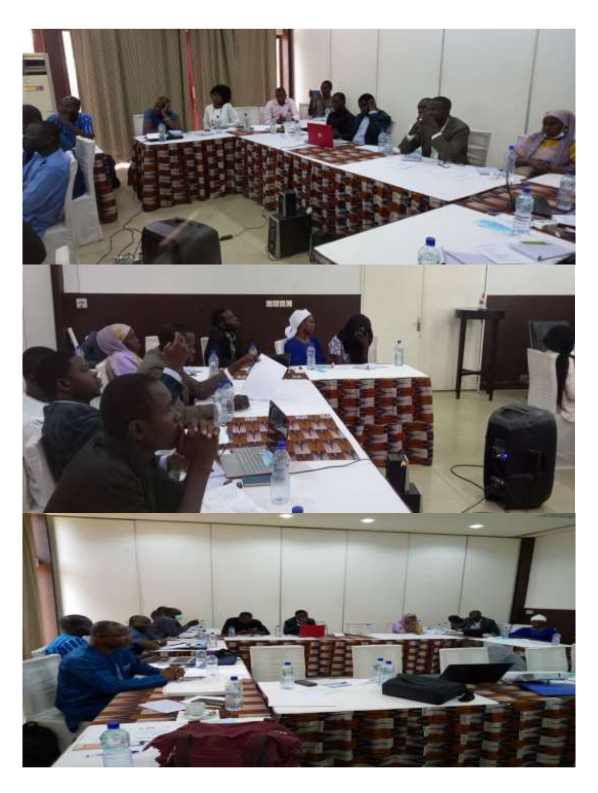
Participants are following